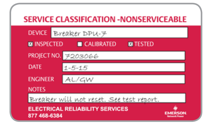
Figure 1. Field testing labels help satisfy documentation requirements of NFPA 70E 2015.